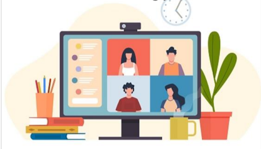
pure virtual mobilities

The programme's vision is to enable the teachers of tomorrow to interact in a culturally sensitive way with an increasingly diverse student body.